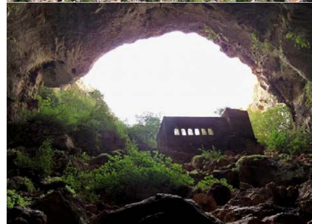
Heaven & Hell Sinkholes (Cennet Cehennem), Mersin