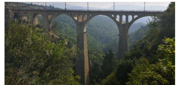
Varda Bridge, Karaisali, Adana