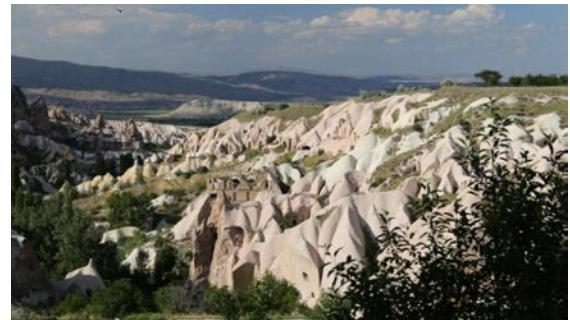
Pigeon Valley, Cappadocia