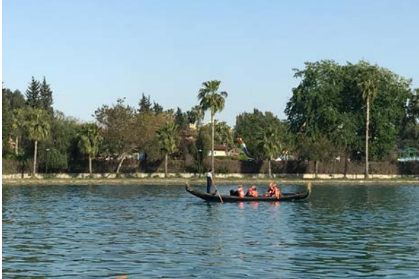
Seyhan River, Adana