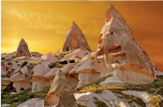
Fairy Chimneys, Cappadocia