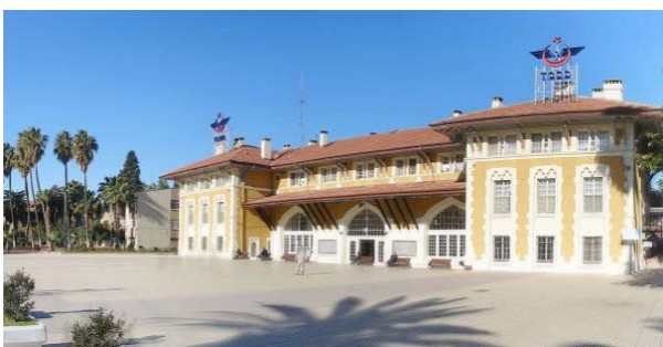
Train Station, Adana