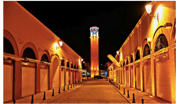
Old Clock, Adana