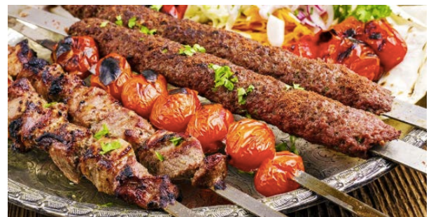
Adana Kebap, Adana