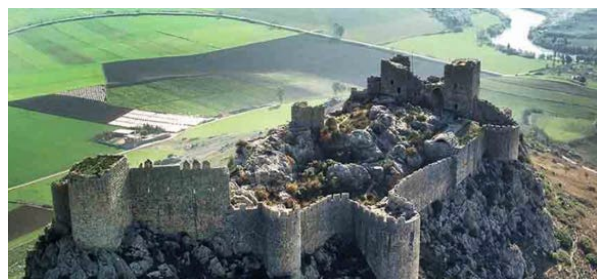
Yilankale (Snake Castle), Adana