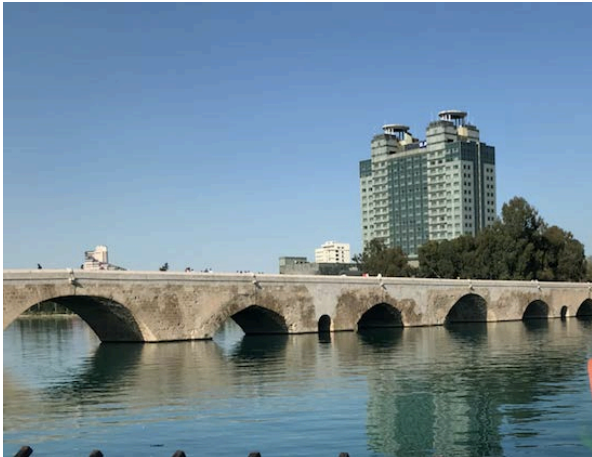
Stone Bridge, Adana (ancient Roman bridge)