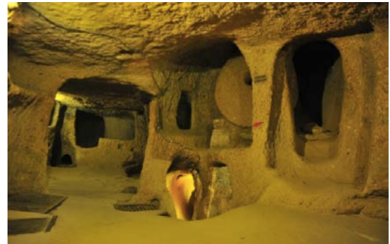
Underground City, Capadocia