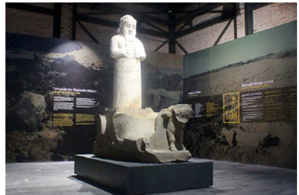
Adana Archeology Museum, Adana