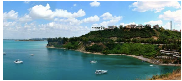
Seyhan Dam Lake, Adana