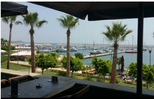
Yacht Marina, Marina