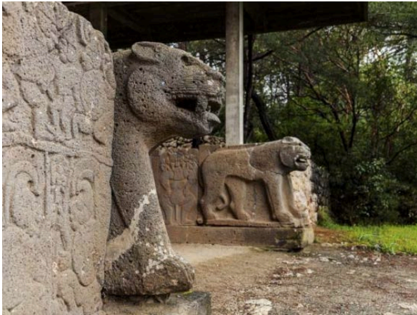
Karatepe- Aslantaş Open Air Museum, Kadirli