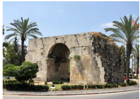
Cleopatra's Gate, Tarsus