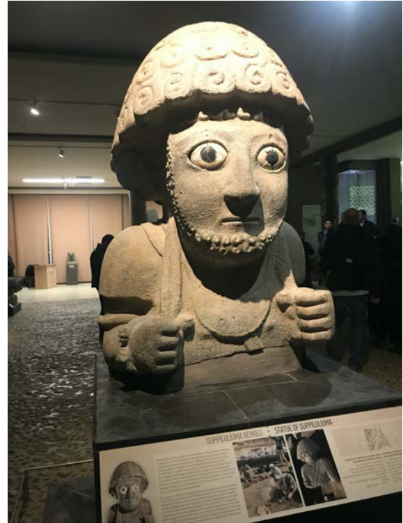
Antiochia Museum, Antakya