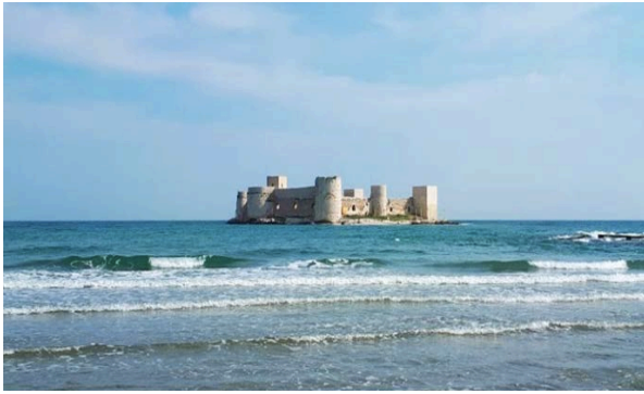
Kızkalesi (Maiden Castle), Mersin