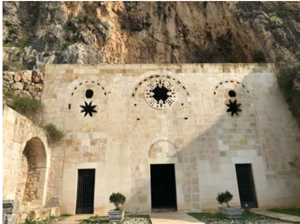
Saint Pierre's Church, Antakya