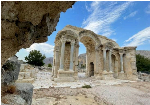
Anavarza ancient Roman road, Adana