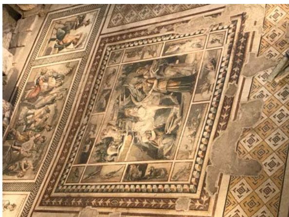
Museum Hotel, Antakya