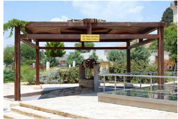
Saint Paul's Well, Tarsus