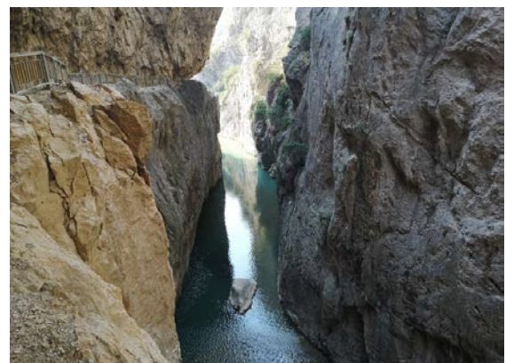
Kapıkaya Canyon, Adana