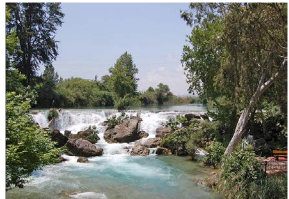
Tarsus Waterfall (Şelale), Tarsus