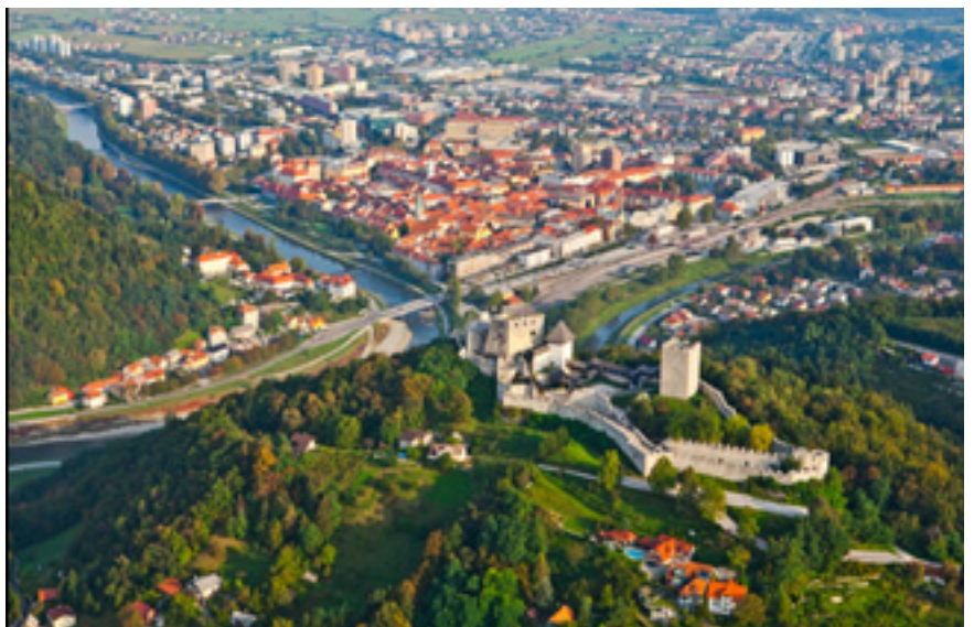
City of CELJE

Celje is another ancient-roman city in Styria. The city center with beautiful buildings and the remains of castle tells stories of an ancient glory of Celeia. There will also be a traditional “Cocktail party”, which is one of the best events on the Slovenia trip. Guests will get the opportunity to meet a lot of new people and have fun with them.