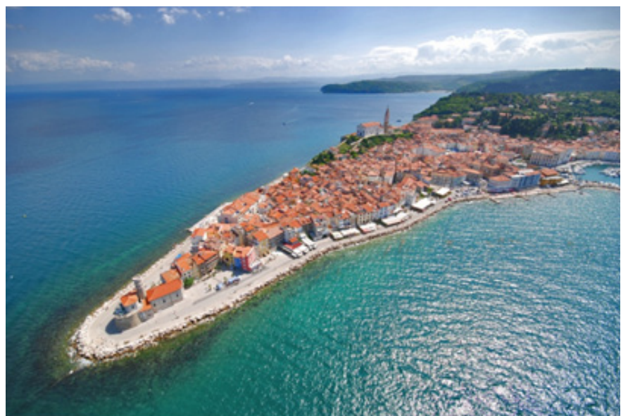
PIRAN, our piece of paradise

The proximity of Italy surely left its mark on this part of Slovenia. The guests will have an opportunity to enjoy the sea as well as to get to know the hinterland of the coast. For two days the guests will enjoy the sun on the beach and the refreshing breeze of the night in coastal cities