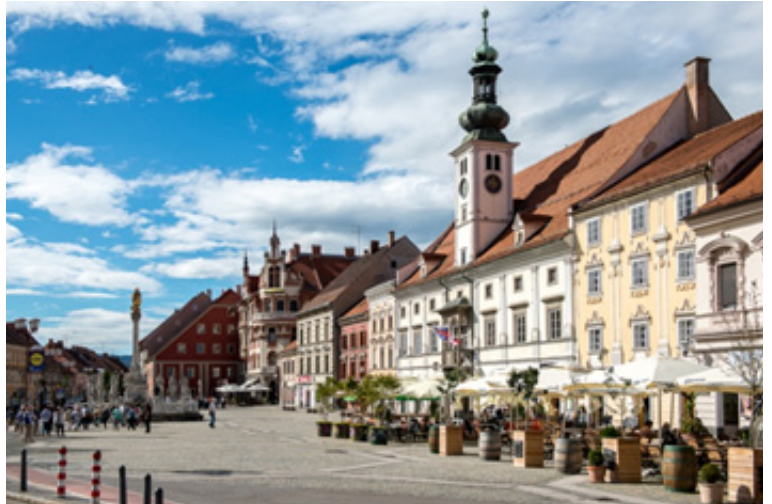
Main square in the city of MARIBOR

Maribor is the capital of Styria and the second largest city in Slovenia. Maribor lies at the foothill of Pohorje where the Golden Fox ladies alpine ski world cup takes place every year. In the time of the Slovenia trip, famous Festival Lent will take place on the bank of Drava River. Guests will have an opportunity to see the old city center of Maribor and the oldest vine in the world. Ptuj was built on the grounds of ancient – roman Poetovio and is the oldest city in Slovenia. With its ancient city center and historic castle, the city on the banks of Drava is certainly full of history.