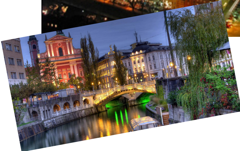
LJUBLJANA. Our beauty. Our Capital. Your place to visit.

Whereas it has won the title of the 2016 European Green Capital, some are already comparing it to Berlin for its recent increase in coolness and hipster culture.